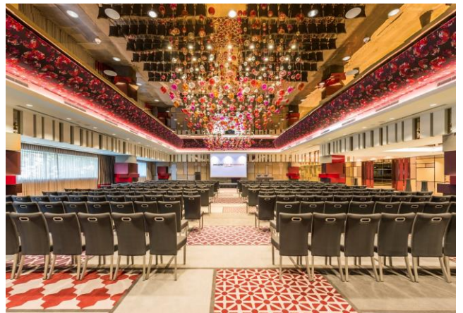
Neuchatel and Asuka Hall